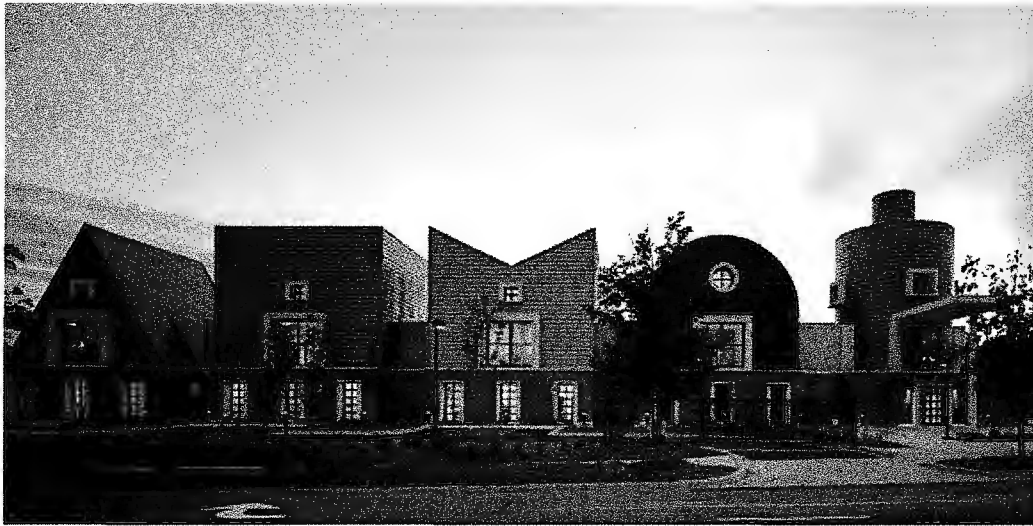
Graves, "St. School west facade"

The first picture depicts five houses in a row. The geometrically shaped houses are all attached and together make up the façade, which is covered in glossy tiles. These houses are also represented in the school's logo, which demonstrates the building blocks for life that the school provides to the students. The geometric and symmetrical shapes are very simple making each building easily distinguishable and describable. This way, students can make their way around the school on their own because they can recognize these shapes and remember them more easily. In addition, they can associate their class to the shape or color of the house it is in. because of their innocent appearance, the houses contribute to a playful and welcoming atmosphere. Since each shape is unique, each building has equal attention and can easily be seen or spotted out from the others. Although they are all different, each building shares a symmetrical element providing harmony and balance to the whole structure. Furthermore, the variety of shapes and colors is visually stimulating and the simple shapes are engaging to the students. The soft pastel colors of these houses contrast the bold elements in the design. Nevertheless, they